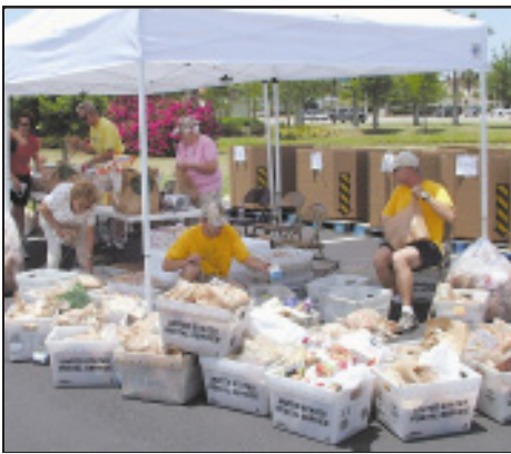
Food drives, like last year's Letter Carriers' Drive (above), garner thousands of pounds of food with the help of many volunteers.