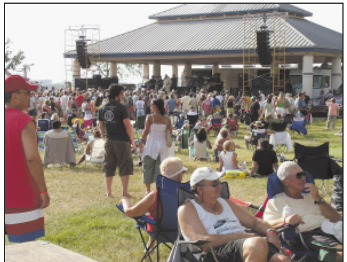
Family and friends filled Centennial Park in 2006 for last year's River & Blues Festival.

You can donate right from our home page at www.harrychapinfoodbank.org or call (239) 334-7007 for assistance.