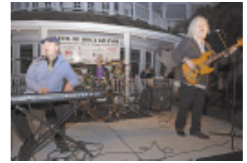
Music rocked, wine poured, and food overflowed at the 5th annual "Taste of Boca Grande."